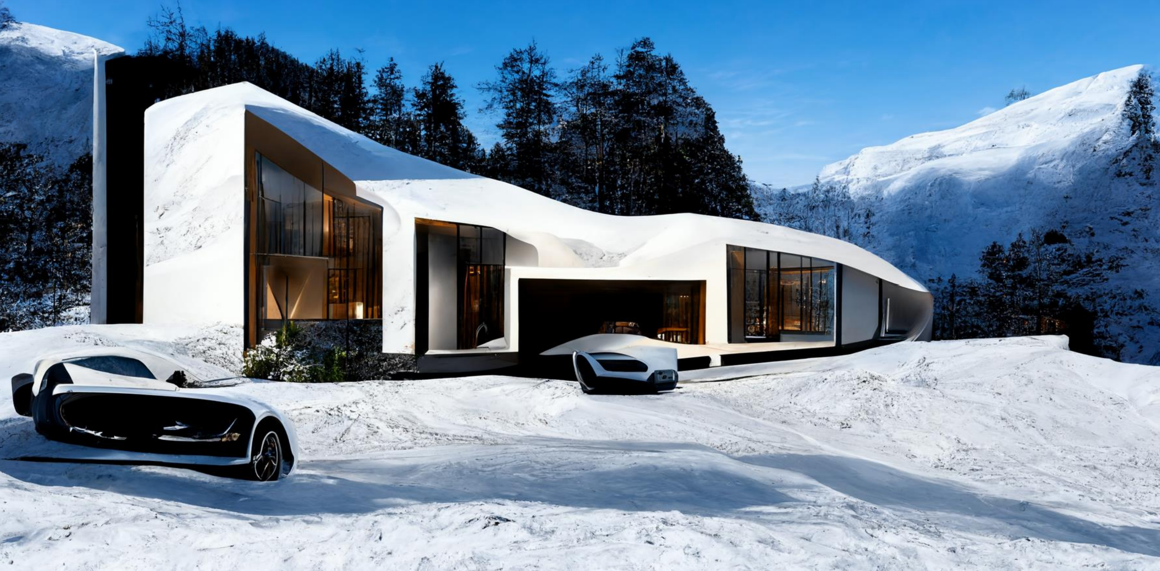
/imagine: a modern mountain side villa with a luxury car parked in the driveway during the winter snow season